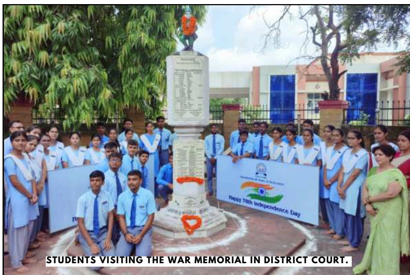
STUDENTS VISITING THE WAR MEMORIAL IN DISTRICT COURT.