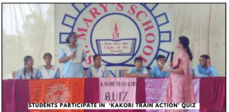
STUDENTS PARTICIPATE IN 'KAKORI TRAIN ACTION' QUIZ