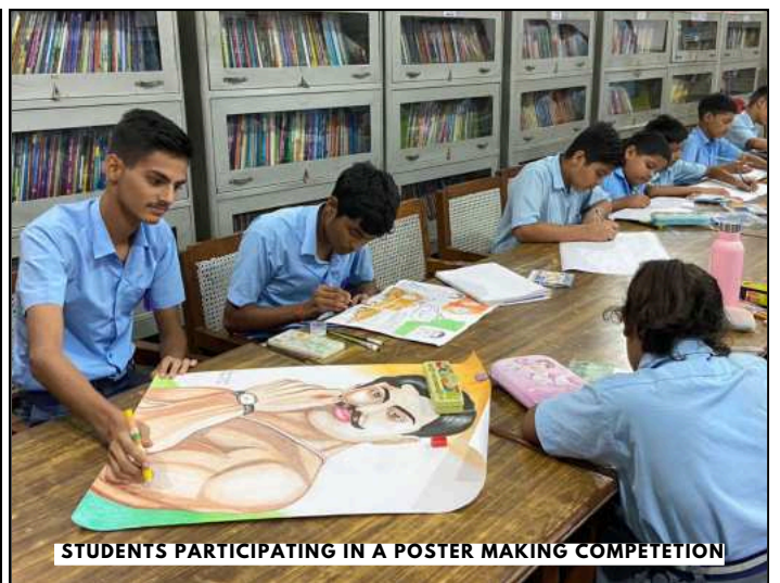
STUDENTS PARTICIPATING IN A POSTER MAKING COMPETITION