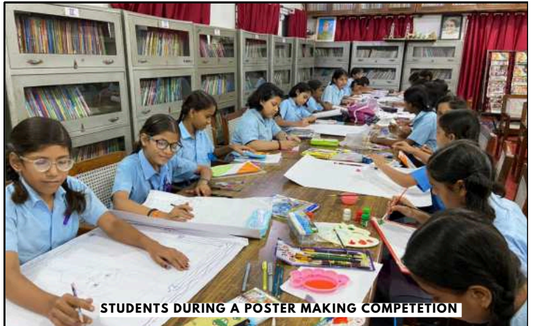
STUDENTS DURING A POSTER MAKING COMPETITION

The week-long celebration seamlessly blended education, creativity, and festivity, leaving a lasting impression on all participants. St. Mary's School continues to inspire its students to uphold the values of unity, dedication, and pride, making this Independence Day celebration a truly memorable and impactful occasion.