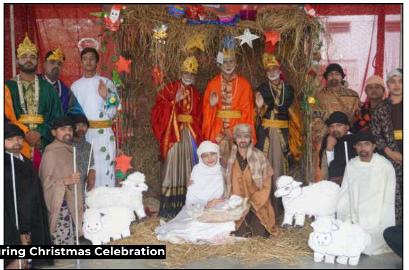
The Nativity Play during Christmas Celebration