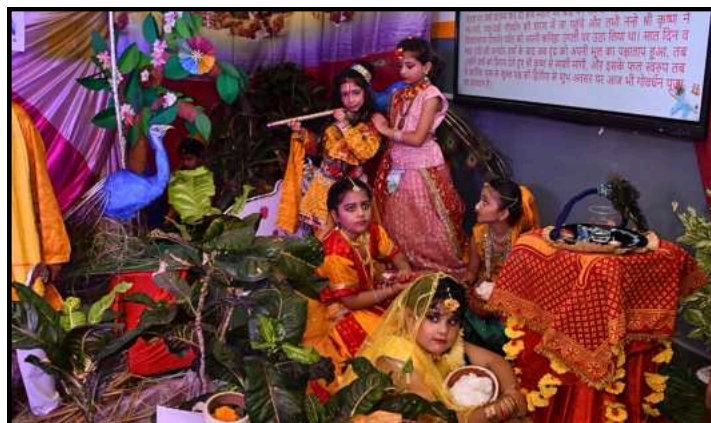
Students during the Janmashtmi Jankhi celebration