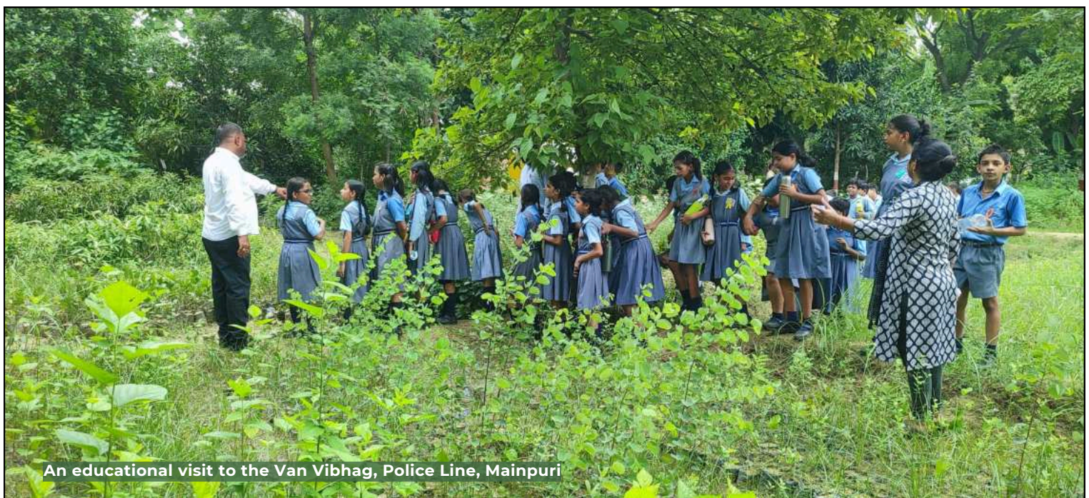
An educational visit to the Van Vibhag, Police Line, Mainpuri