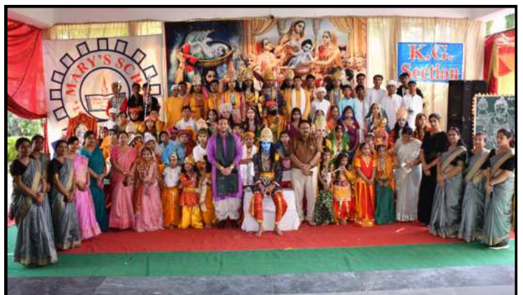
A group photo of the participants with their house Incharges